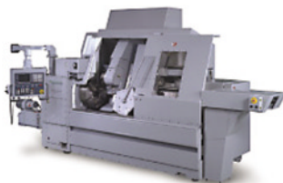
Warner & Swasey

Kentucky Rebuild Corp. / 10065 Toebben Drive Independence, KY 41051